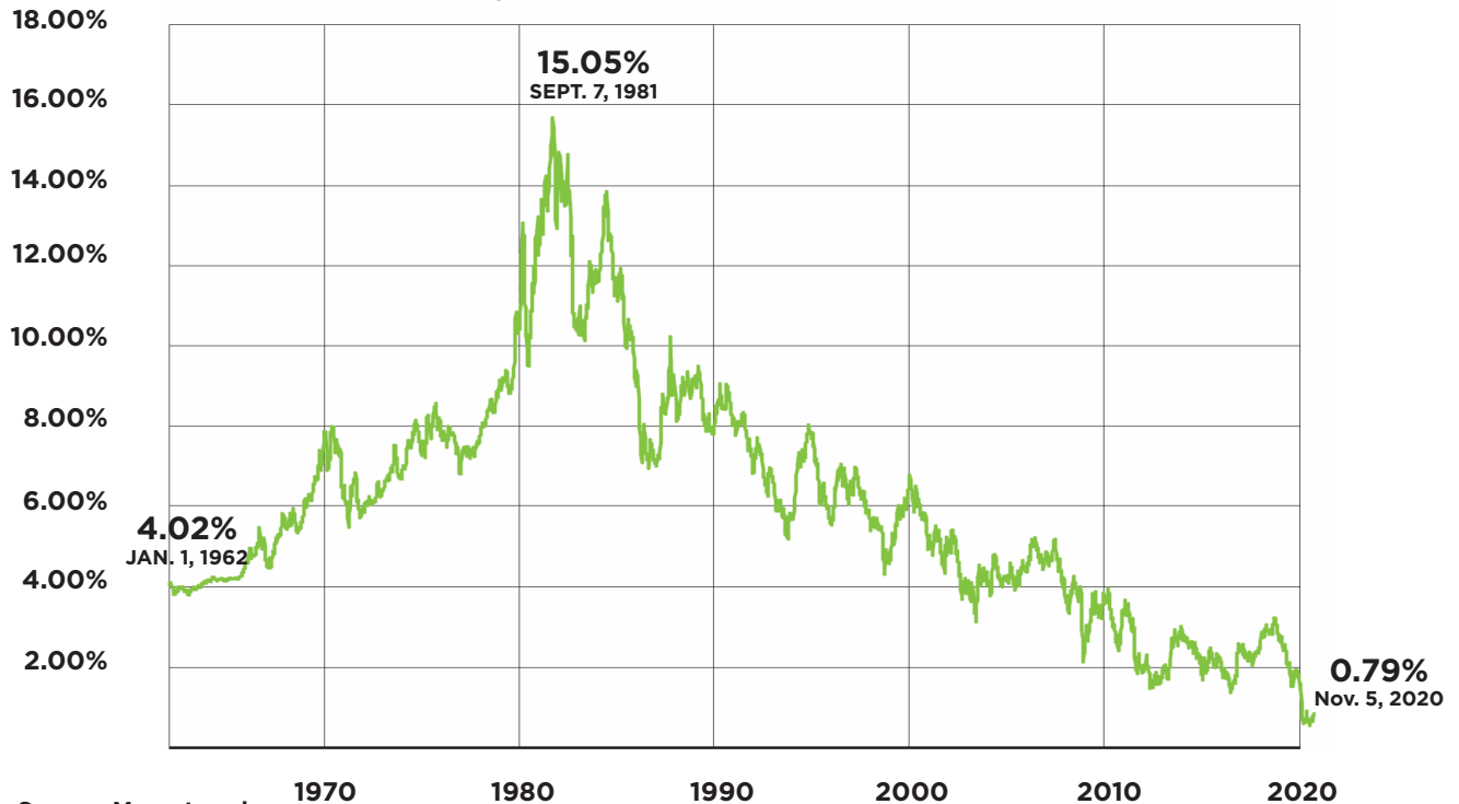
10-Year Treasury Bond Yield Chart 1970-2020