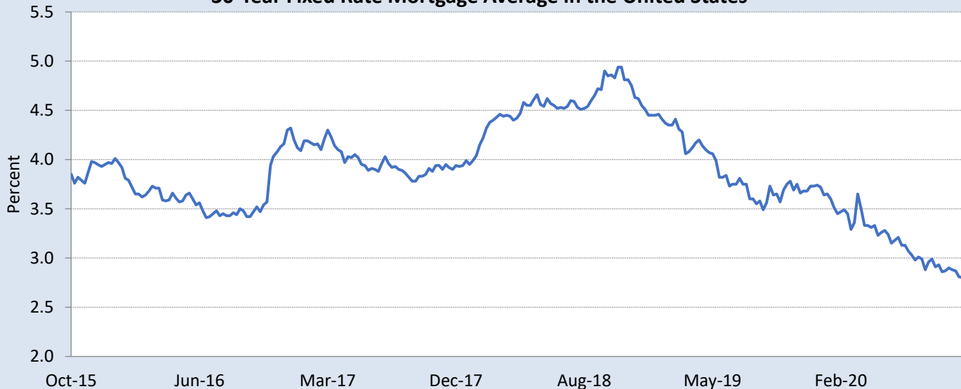
30-Year Fixed Rate Mortgage Average in the United States